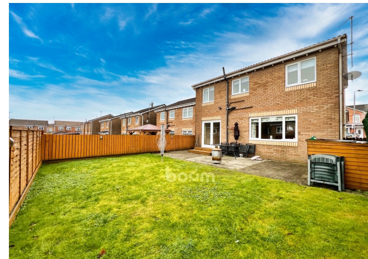
12 Blackwood Terrace, Johnstone