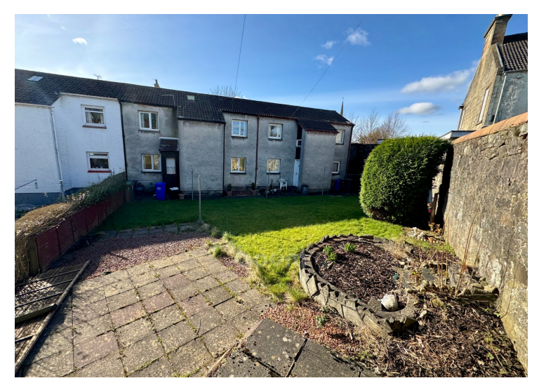
5 Campbell Street, Johnstone