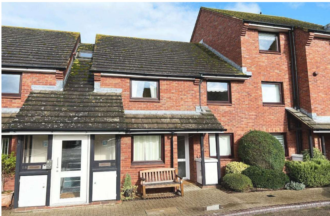
Fairhaven Court, Egham, Surrey, TW20 9DH £210,000 Leasehold