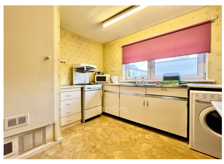
15, 2/1 Cairnhill Drive, Glasgow