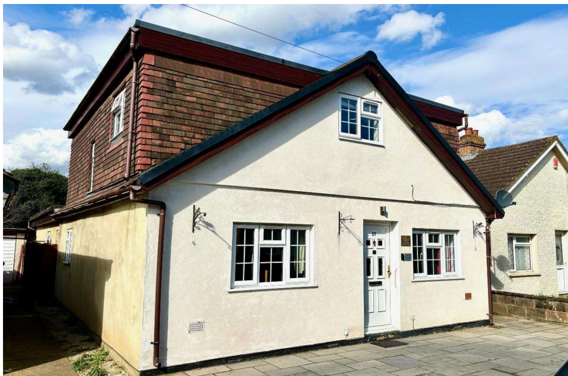
Rusham Road, Egham, TW20 9LP