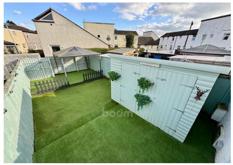
Braehead, Girdle Toll, Irvine