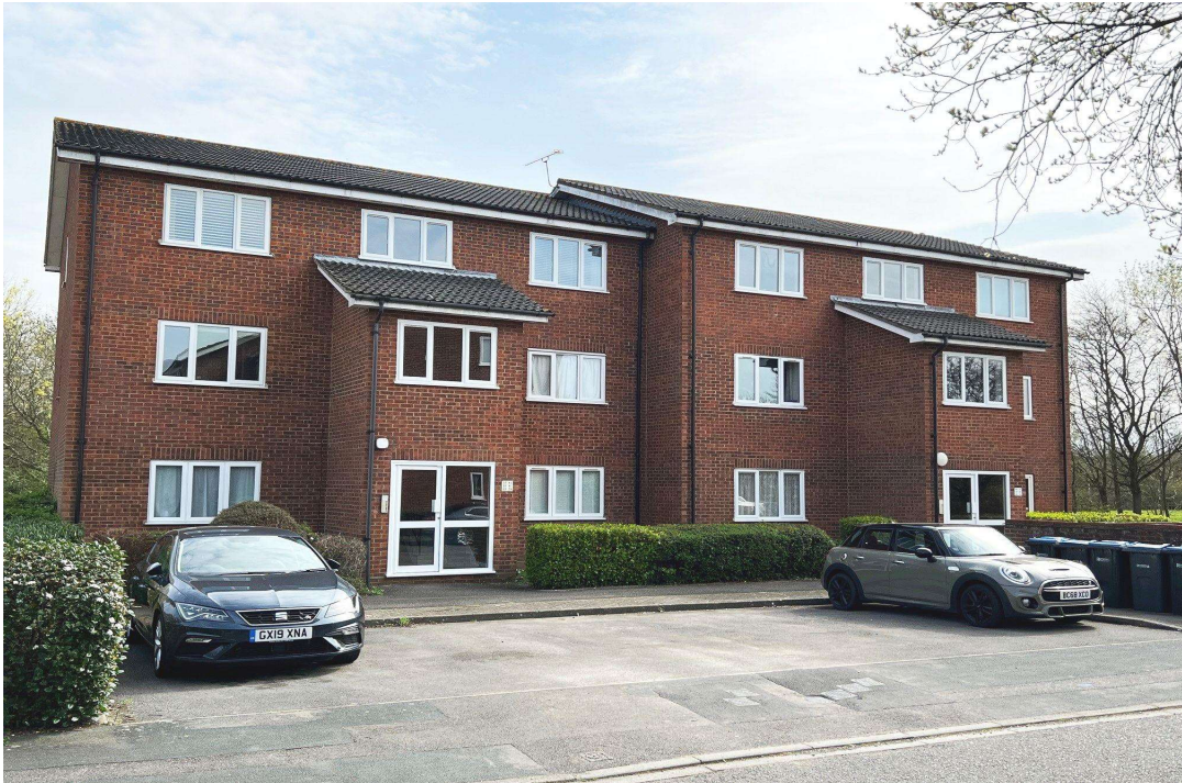
Wesley Drive, Egham, Surrey, TW20 9JA £250,000 Leasehold