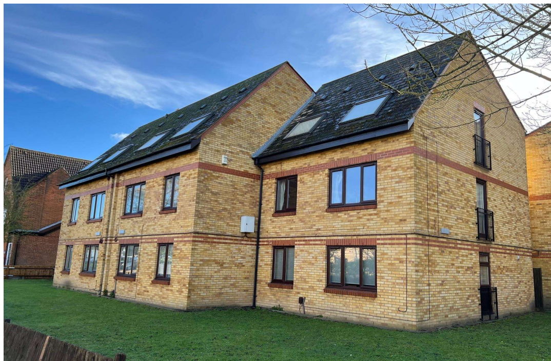
Cherry Orchard, Staines, TW18 2DG