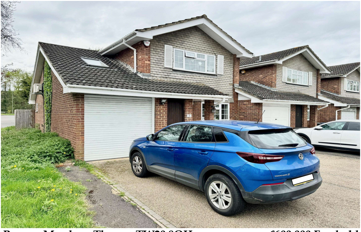
Bourne Meadow, Thorpe, TW20 8QH