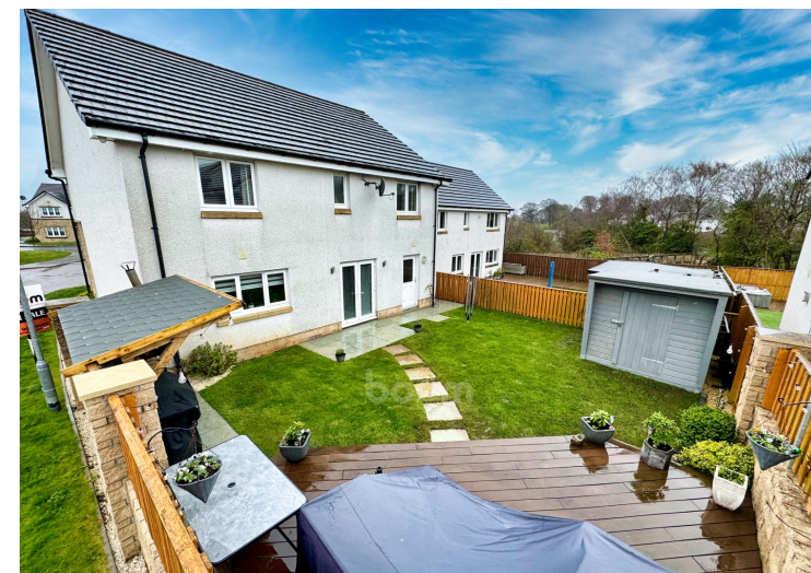
11 McKelvie Crescent, Barrhead, Glasgow