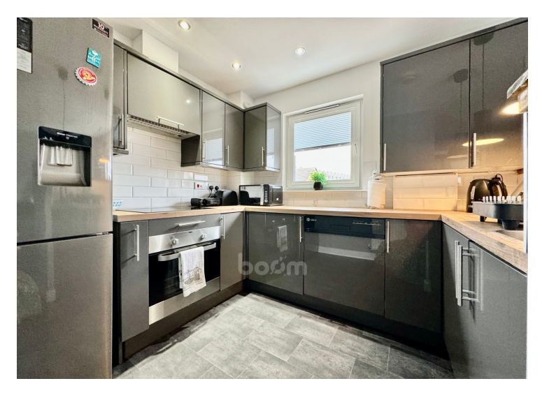
12, Flat 3/4 Springfield Gardens, Glasgow