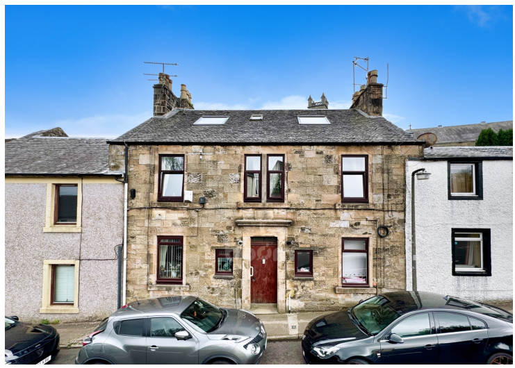
9 (1/1) Townhead, Beith