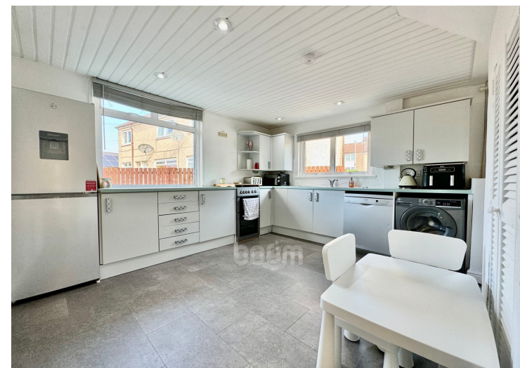
18 Larch Terrace, Beith