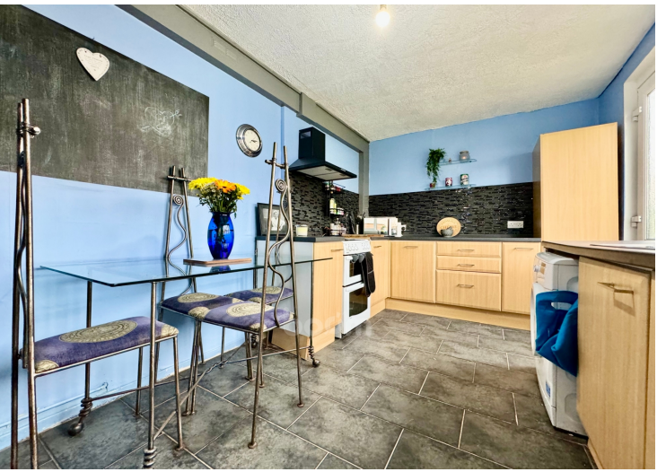
75 Kirkwood Avenue, Clydebank