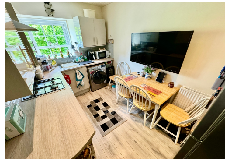
15 Main Street, Beith