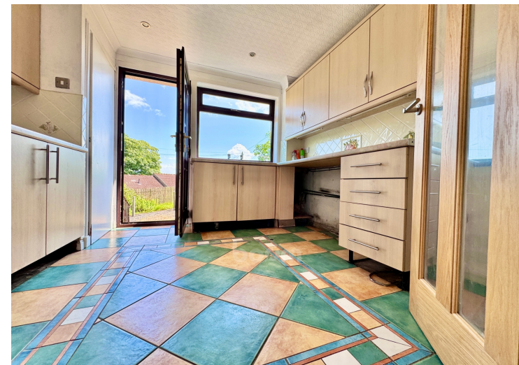
16 Manuel Court, Kilbirnie