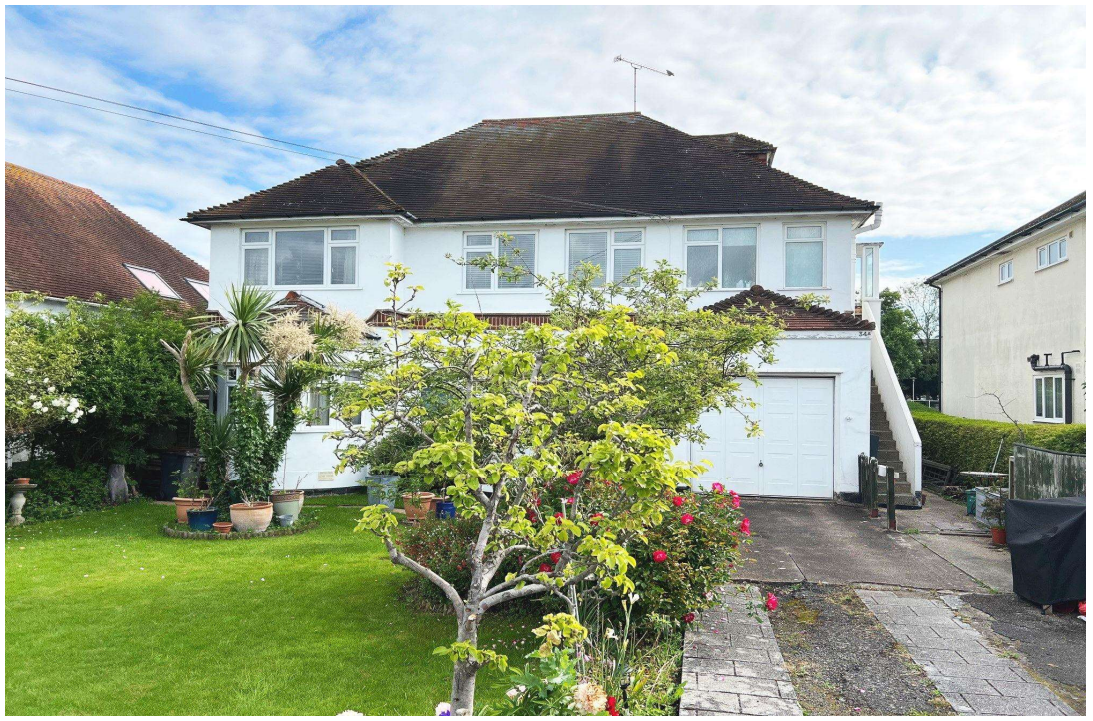
Riverside Drive, Staines, TW18 3JN OIEO £485,000 Freehold