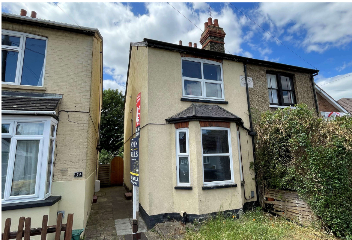
Hythe Park Road, Egham, TW20 8BW