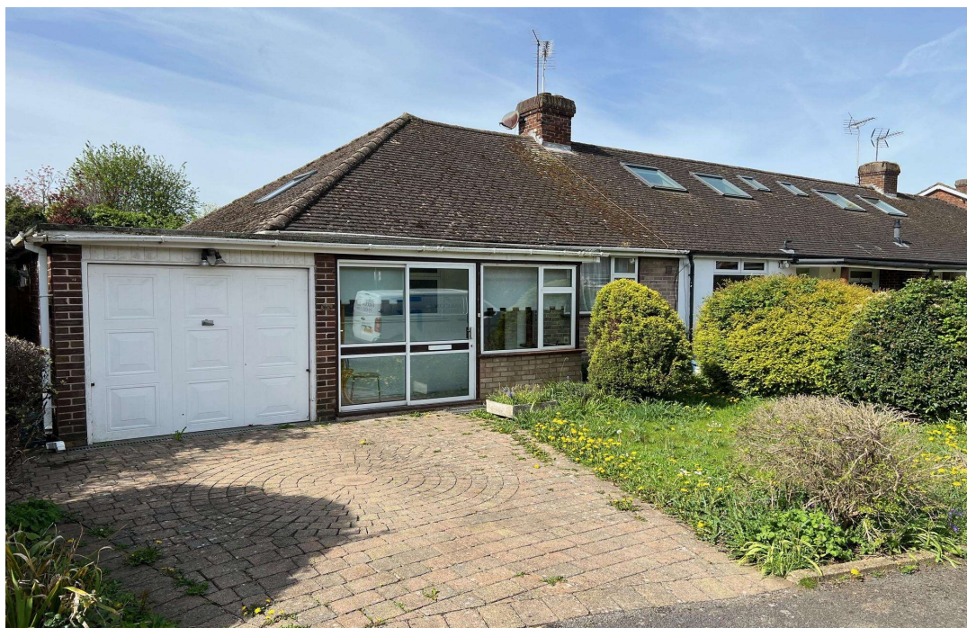
Knightsbridge Crescent, Staines, TW18 2QR