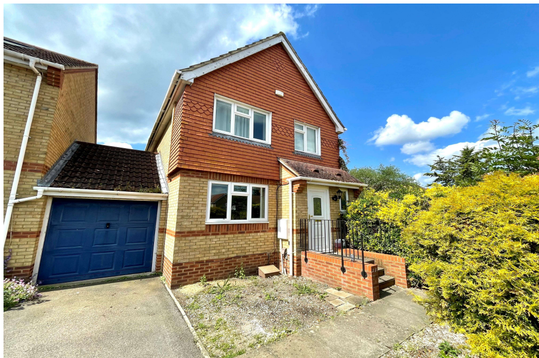
Argent Close, Egham, Surrey, TW20 8XB £490,000 Freehold