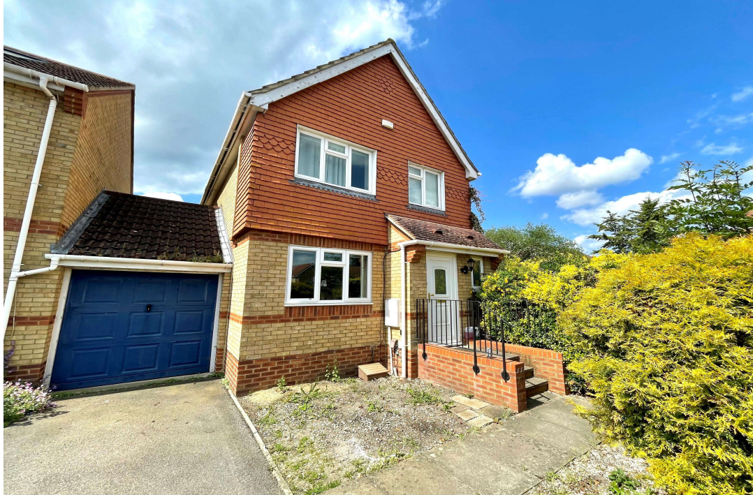
Argent Close, Egham, Surrey, TW20 8XB £490,000 Freehold