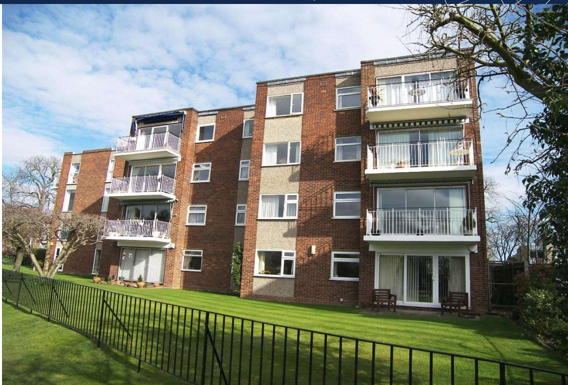
Riverside Road, Staines, TW19 2LP