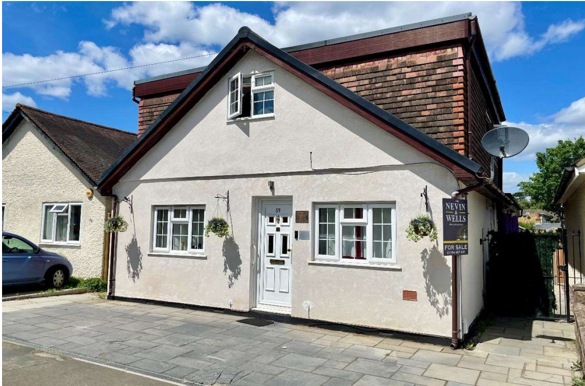
Rusham Road, Egham, TW20 9LP