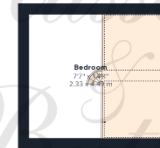
Floor 1 Building 2