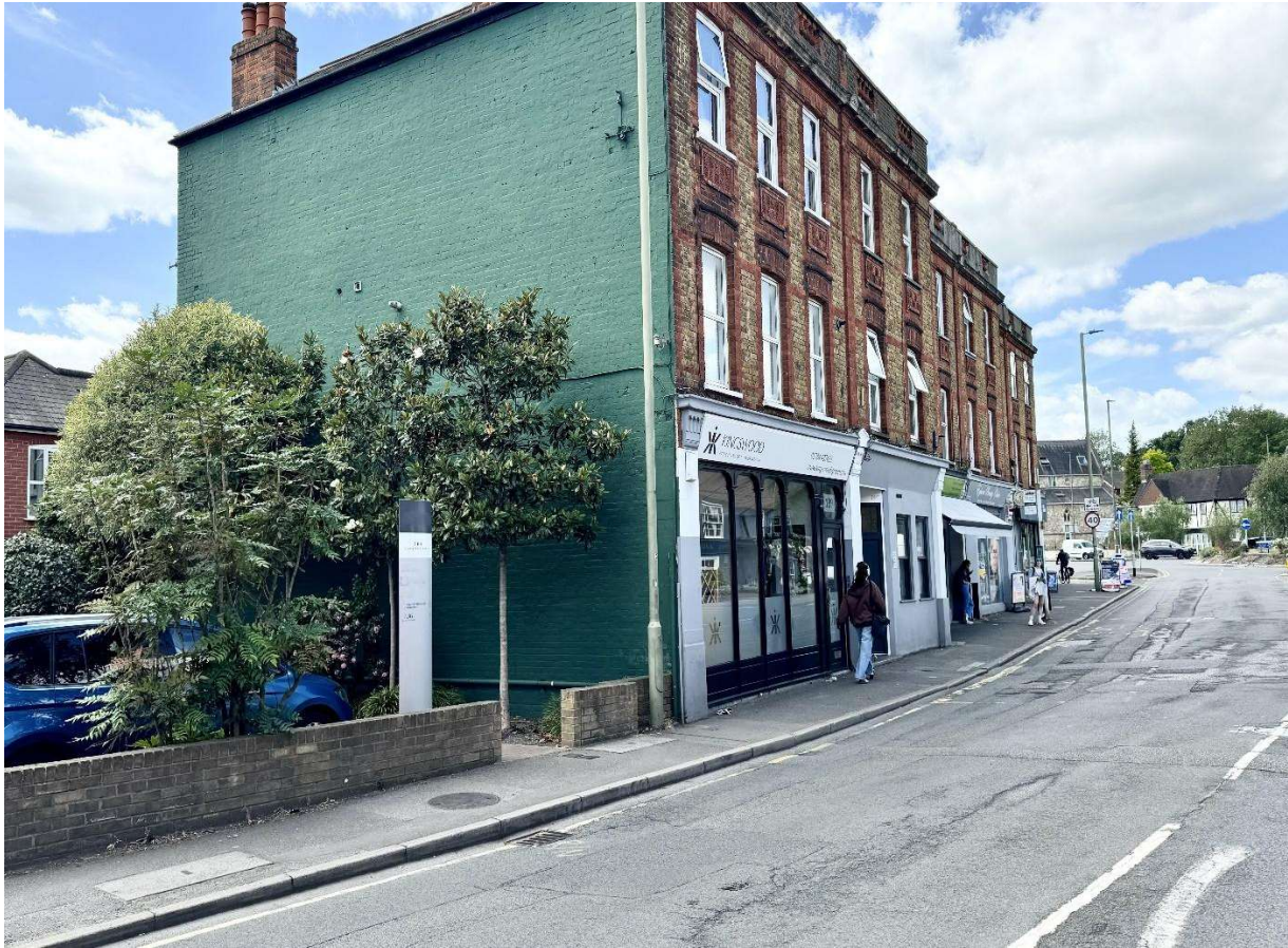
High Street, Egham, Surrey, TW20 9ED