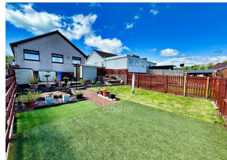
2 Ryeside Place, Dalry