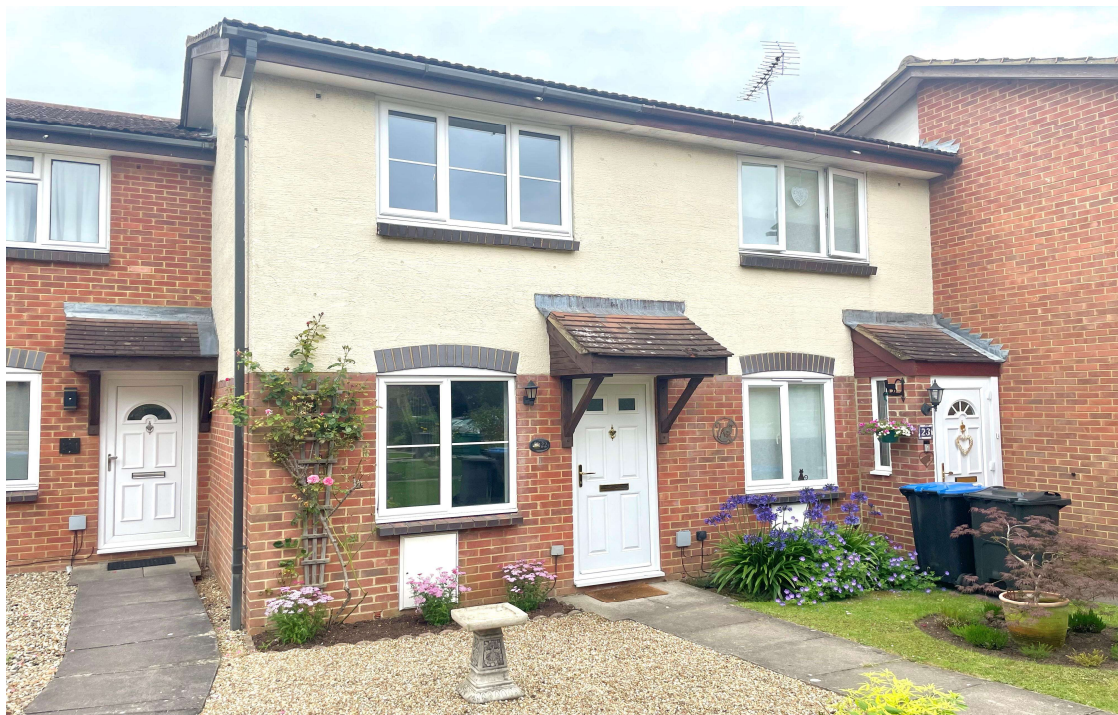
Derwent Road, Egham, Surrey, TW20 8JP OIEO £300,000 F/hold