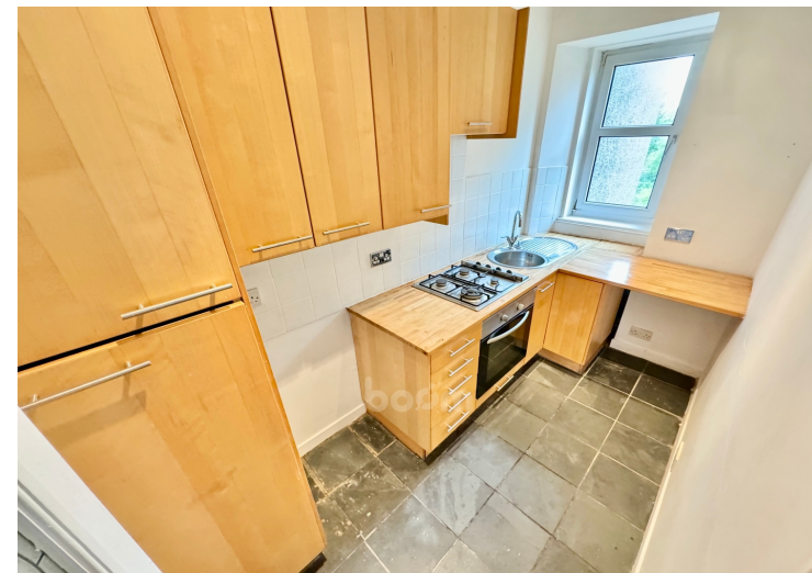
16, 1L Templand Road, Dalry