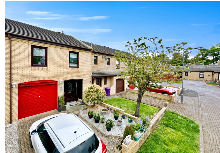
17 Glenlyon Grove, Stanecastle, Irvine