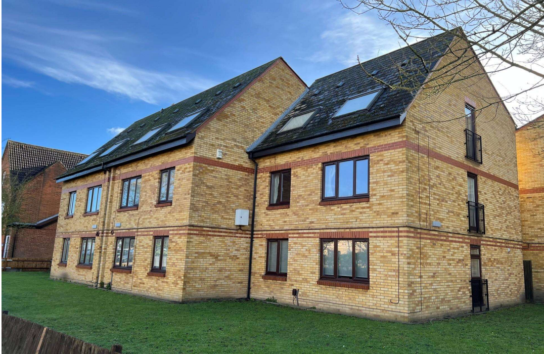
Gresham Court, Staines, TW18 2DG