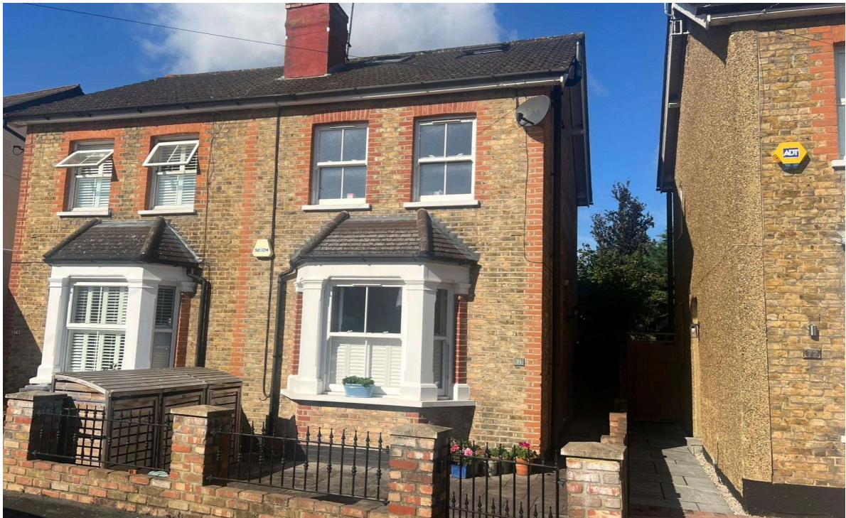
Clarence Street, Surrey, TW20 9QY