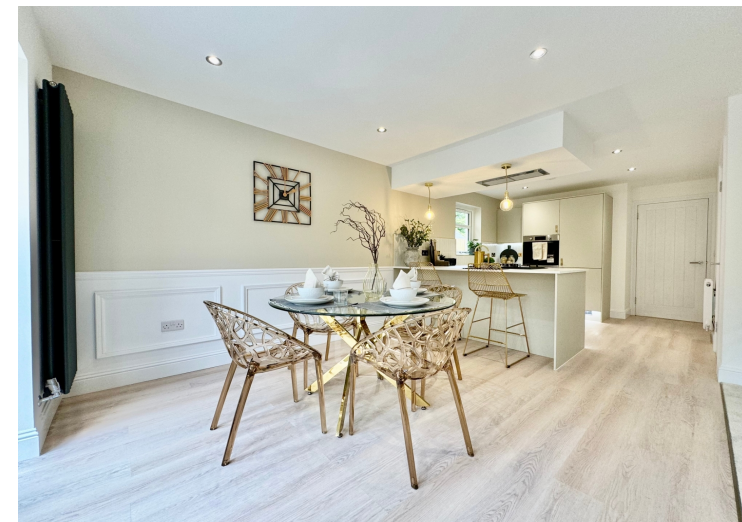
Eglinton Gardens, 37 Head Street, Beith