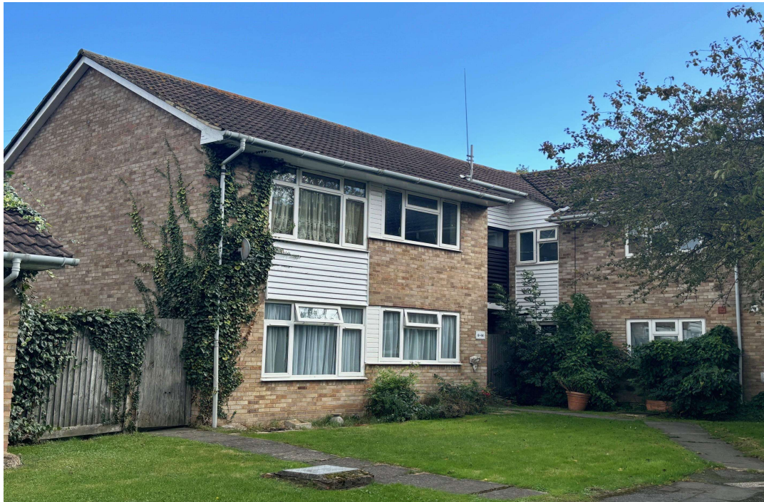
Field View, Egham, Surrey, TW20 8AT £210,000 Leasehold