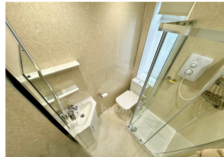
1 McHardy Crescent, Barrmill, Beith