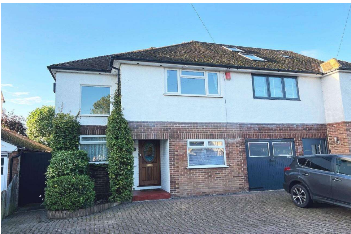
Kingston Road, Staines, Middlesex, TW18 1PG