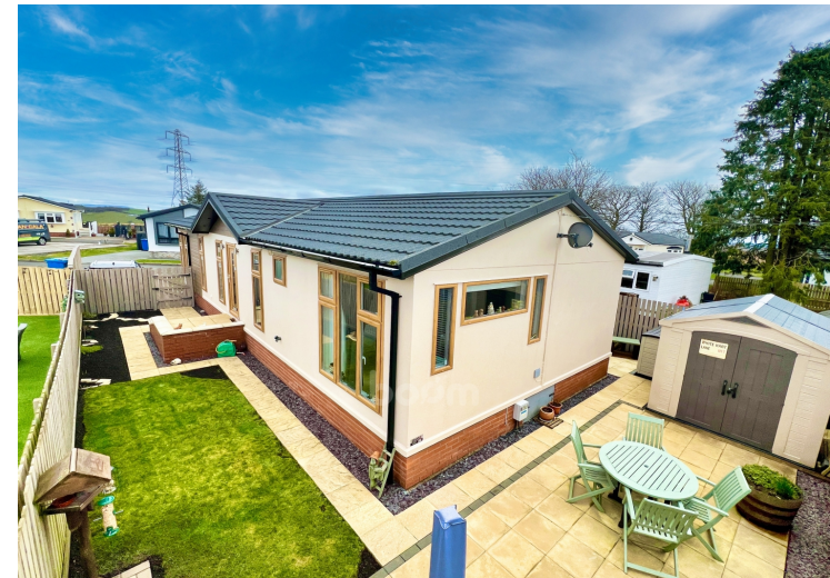
24 Heather Bank Park, Neilston