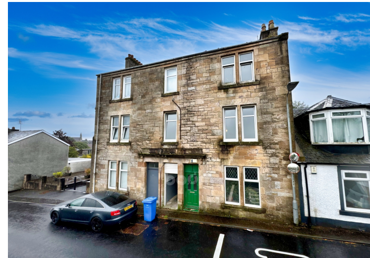
16, 1L Templand Road, Dalry