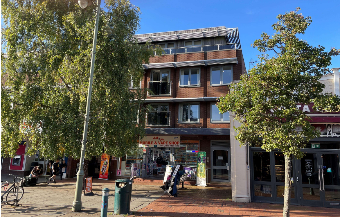
High Street, Egham, Surrey, TW20