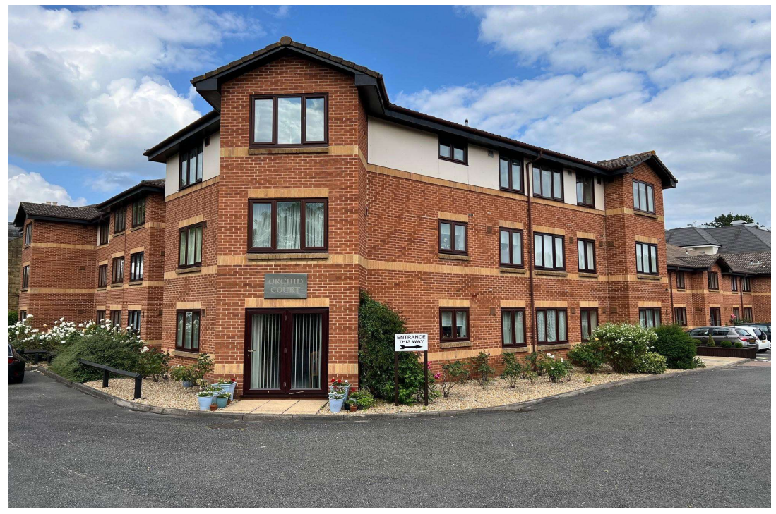
Orchid Court, Egham, Surrey, TW20 9HA £175,000 Leasehold