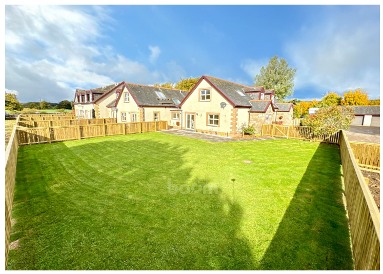
4 Selvieland Farm Cottages, Houston Road, Houston