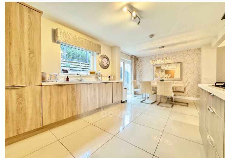
16 Silverbirch Wynd, Port Glasgow