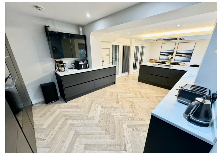
100 Leander Crescent, Renfrew