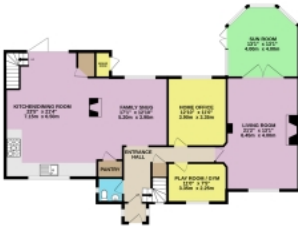
GROUND FLOOR 1693 sq.ft. (157.3 sq.m.) approx.