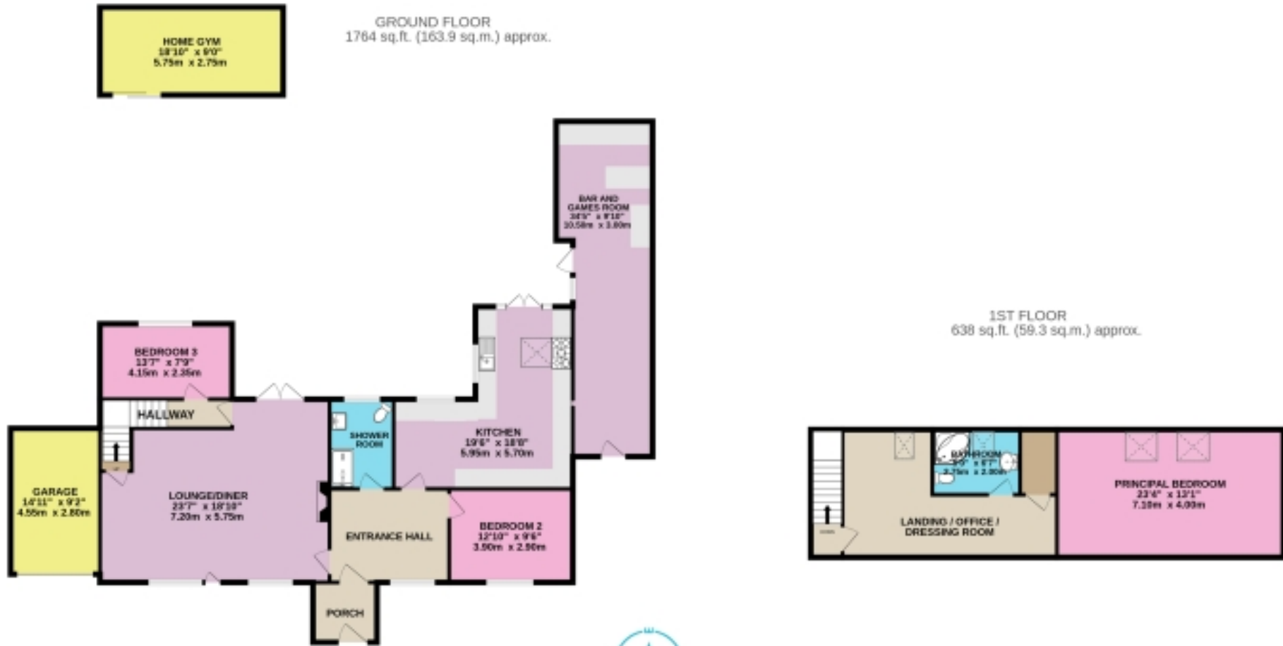
DETACHED 3-BEDROOM CHALET BUNGALOW

TOTAL FLOOR AREA : 2403 sq.ft. (223.2 sq.m.) approx.