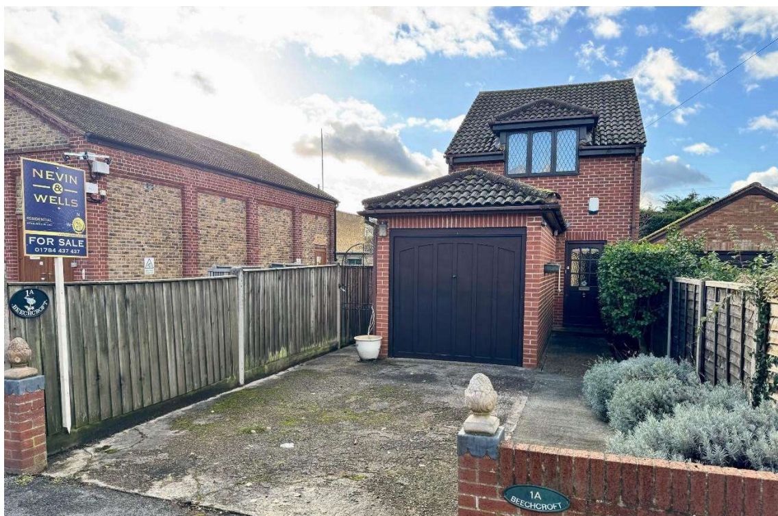
Runnemeade Road, Egham, TW20 9BT