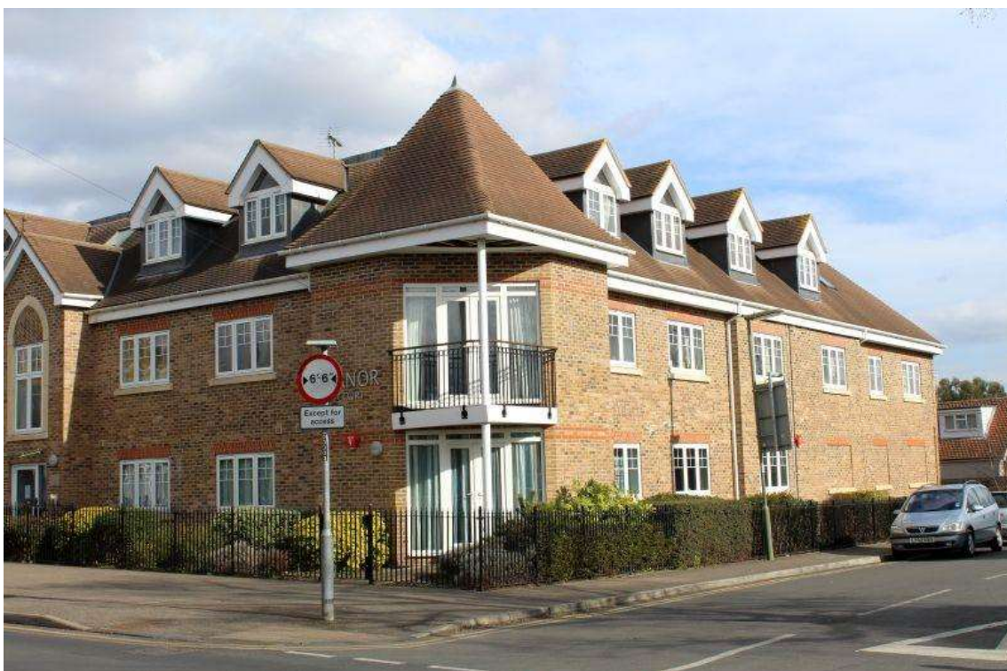
Manor Court, Staines-upon-Thames, TW18 3HT