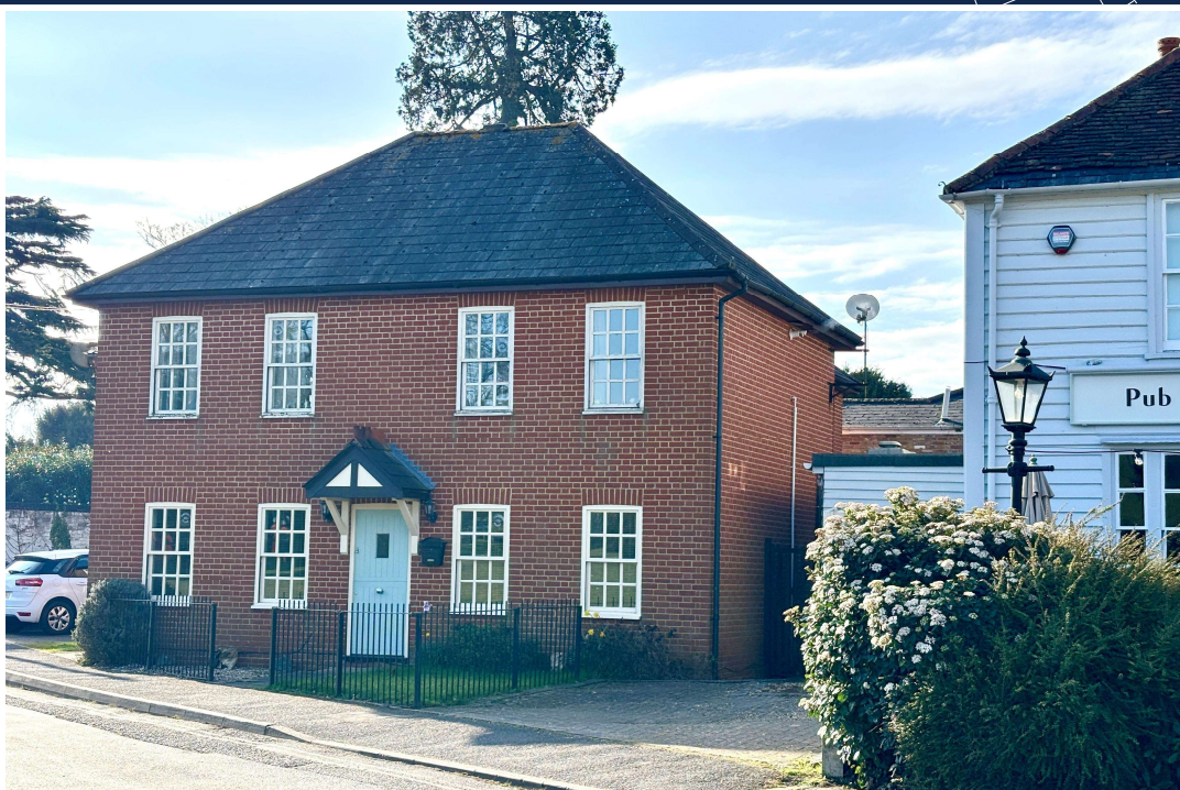
Englefield Green, TW20 0NX