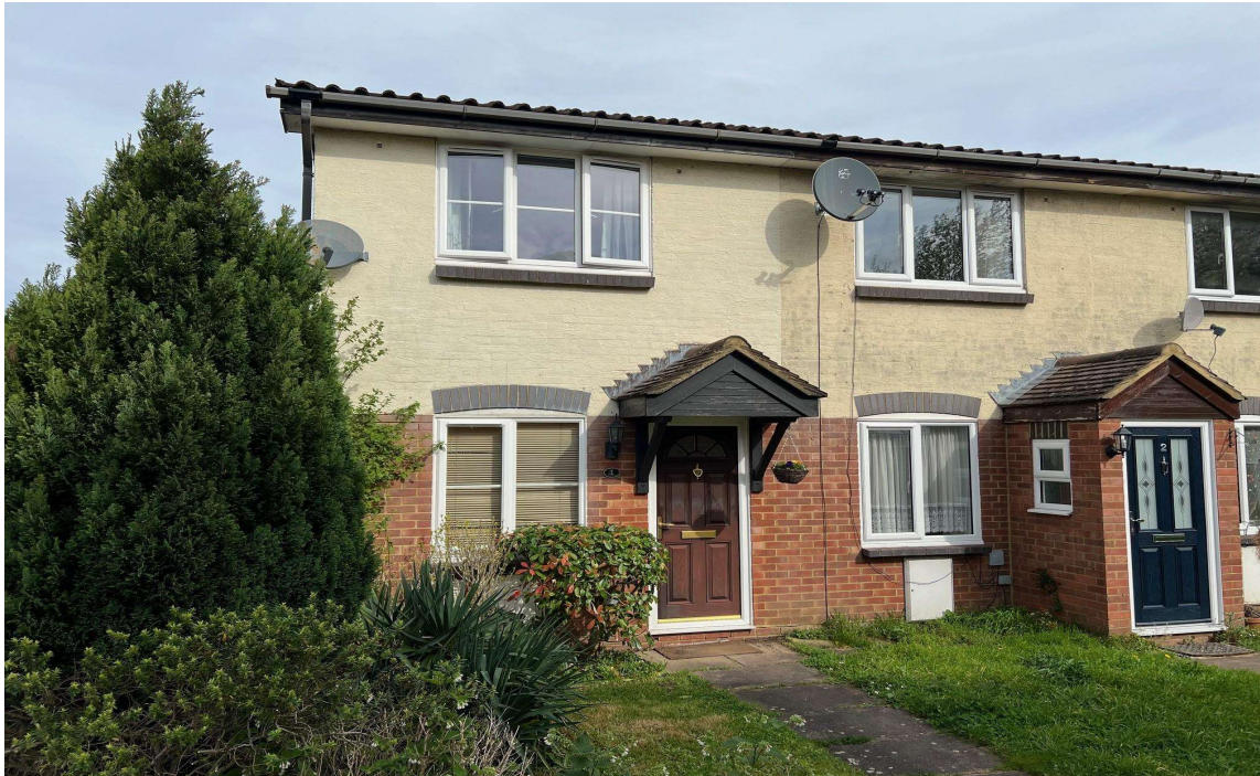
Coniston Way, Egham, Surrey, TW20 8JW