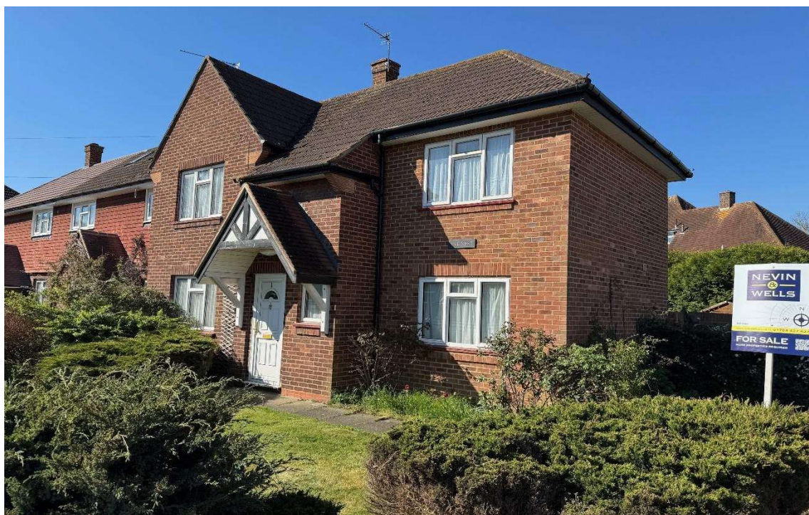
Kent Close, Laleham Middlesex, TW18 1PL