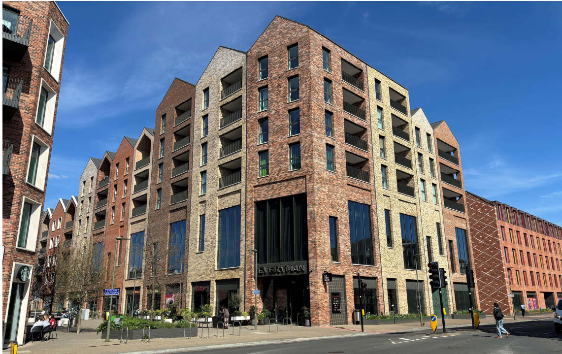
Gem House, Egham, Surrey, TW20 9FG