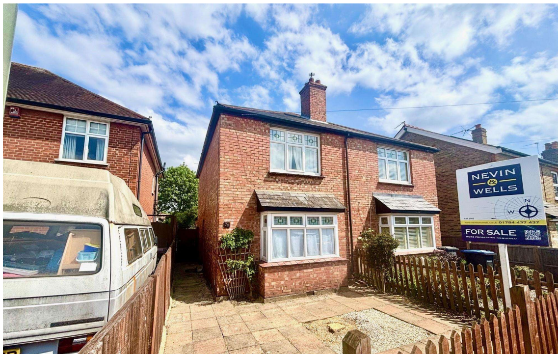
Harvest Road, Englefield Green, TW20 0QR